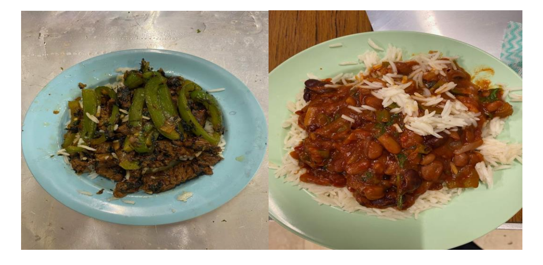
Woodpecker - Veggie Chilli