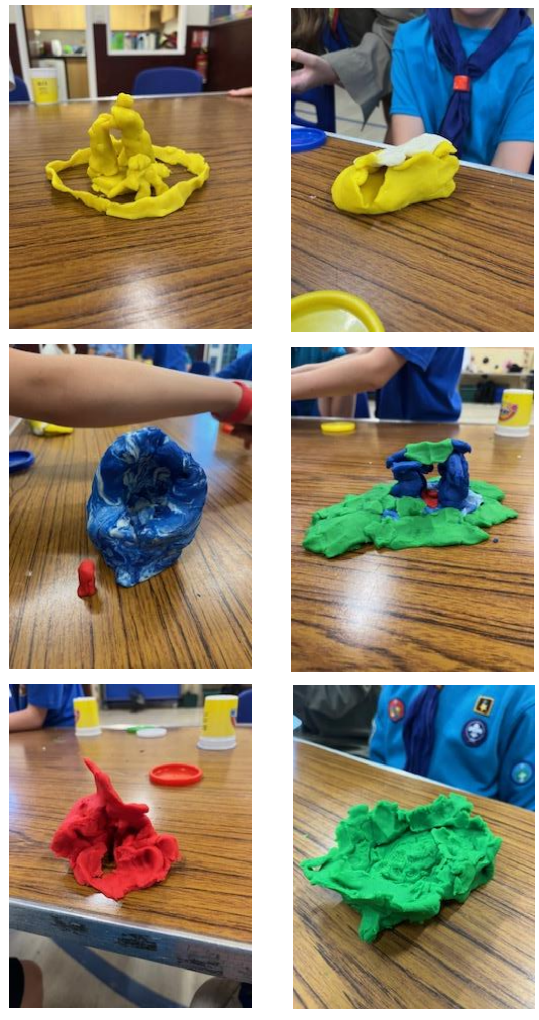
Page 7 of 13